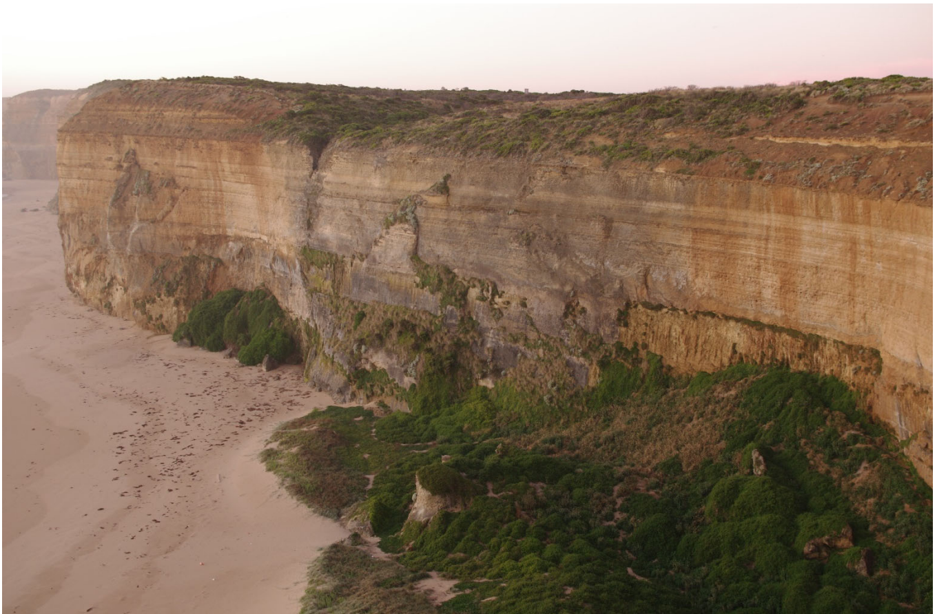
Port Cambell National Park.

The Council continued to use stakeholder insights from this year and previous extensive workshops with stakeholders from across the marine and coastal sector. One of this Council's signature commitments has been the enabling the voice of stakeholders to be heard in marine and coastal planning and management both through the development of the Strategy, and through ongoing advocacy.