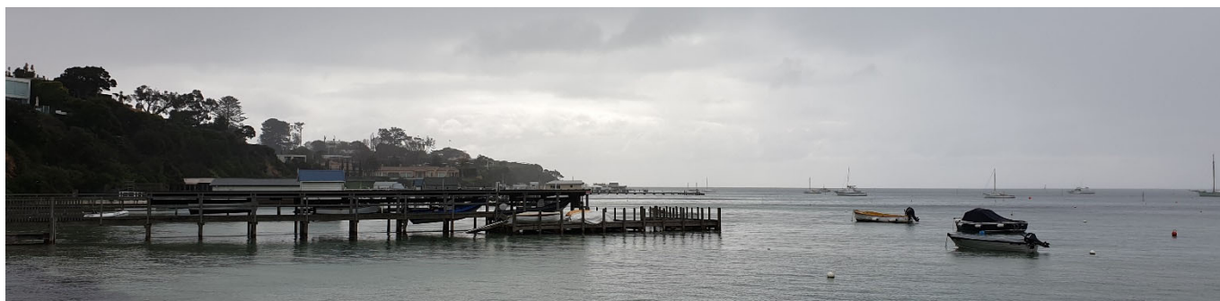
Nairn (Port Phillip) coast at Point King, Portsea.