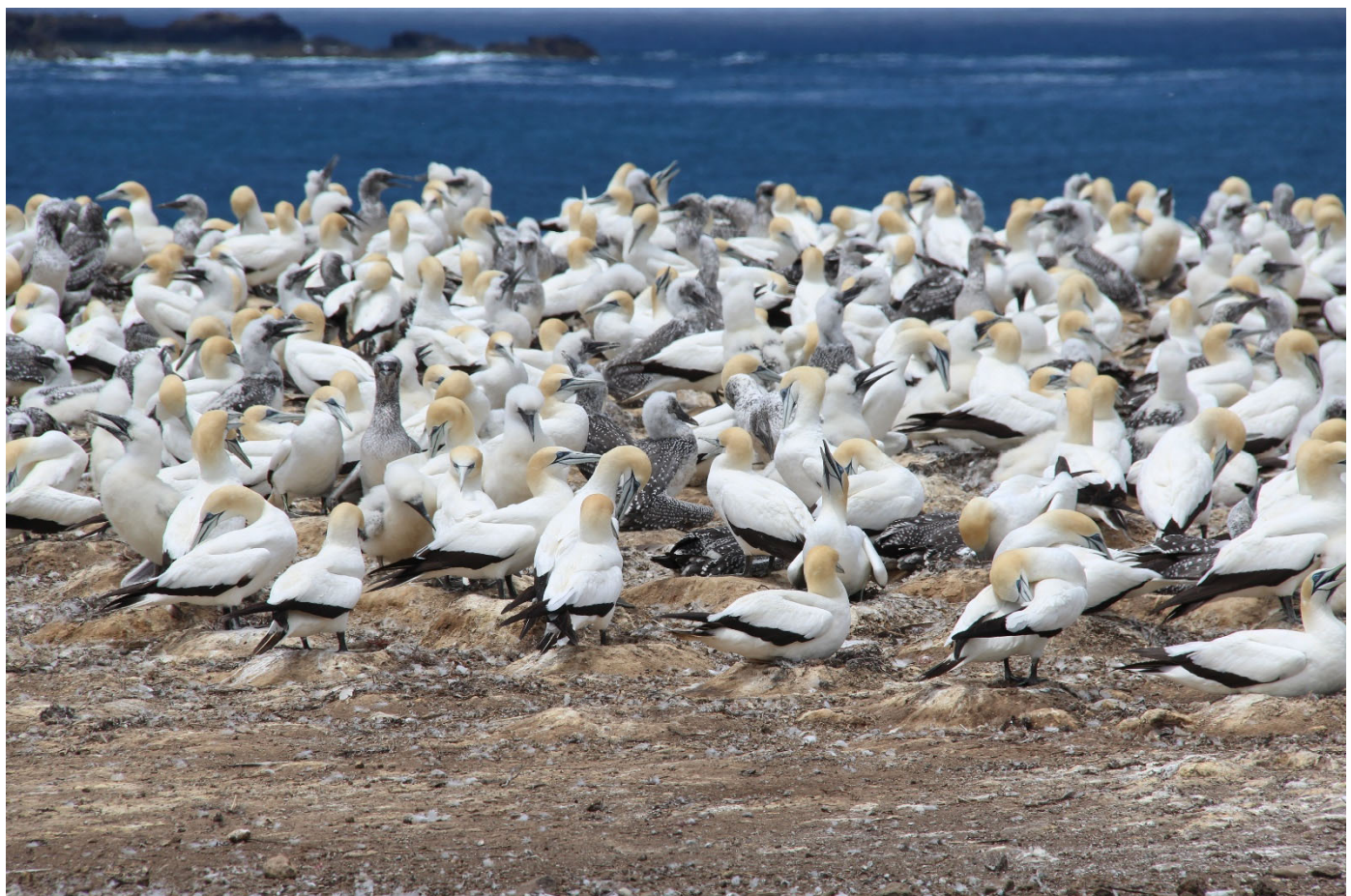
Gannet Colony, Portland.