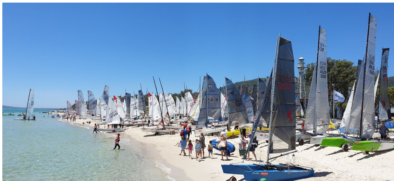
Dinghy regatta below the McCrae Lighthouse, Victoria.

Consistent with requirements of the Public Administration Act 2004 , the Council has adopted a range of policies designed to promote good governance in all its decision making and operations. These policies comprise: Code of Conduct; Conflict of Interest; Dispute Resolution; Gifts, Benefits and Hospitality; Meetings and Decision Making; and Performance Assessment.