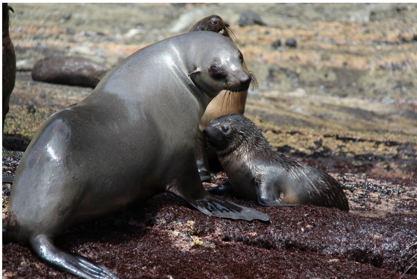
Australian Fur Seals, Cape Bridgwater.