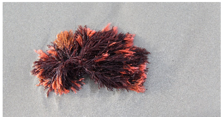
Red Algae. John Sherwood.

The constraints of COVIDSafe settings required continuation of an agile and flexible approach to enable the operation of the Council and, in particular, to ensure the access and input of stakeholders into the development of the Strategy. During the last year, Council continued to adapt its timetable to facilitate stakeholder engagement to maximise safety and connection while maintaining a high standard of service delivery.